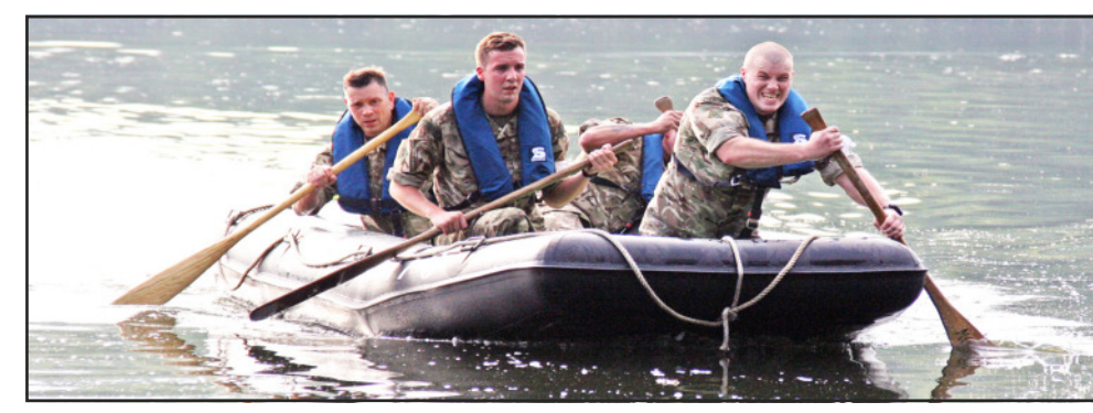
• Team 609 West Riding Squadron RAF, Team 1 during the rubber dinghy exercise