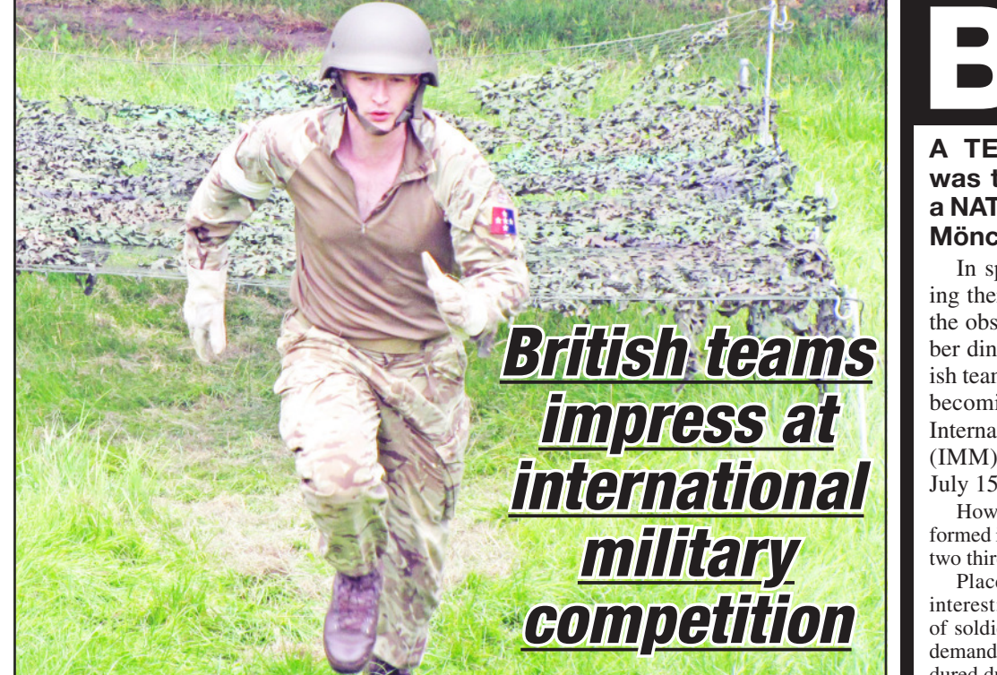
• A member of 74 Sect SIB RMP from Paderborn runs the obstacle course